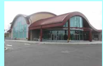
5 Pioneer Blvd., Westampton, NJ

Members' meetings are held every third Tuesday of the month at Burlington County Library Headquarters from September through May. Unless otherwise noted.