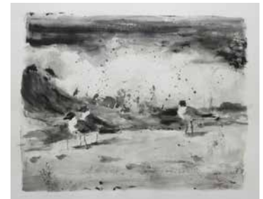
Birds at Shoreline , monotype by Susan Barnes