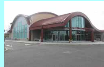
5 Pioneer Blvd., Westampton, NJ

Members' meetings are held at the Burlington County Library every third Tuesday of the month from September - May unless otherwise noted.